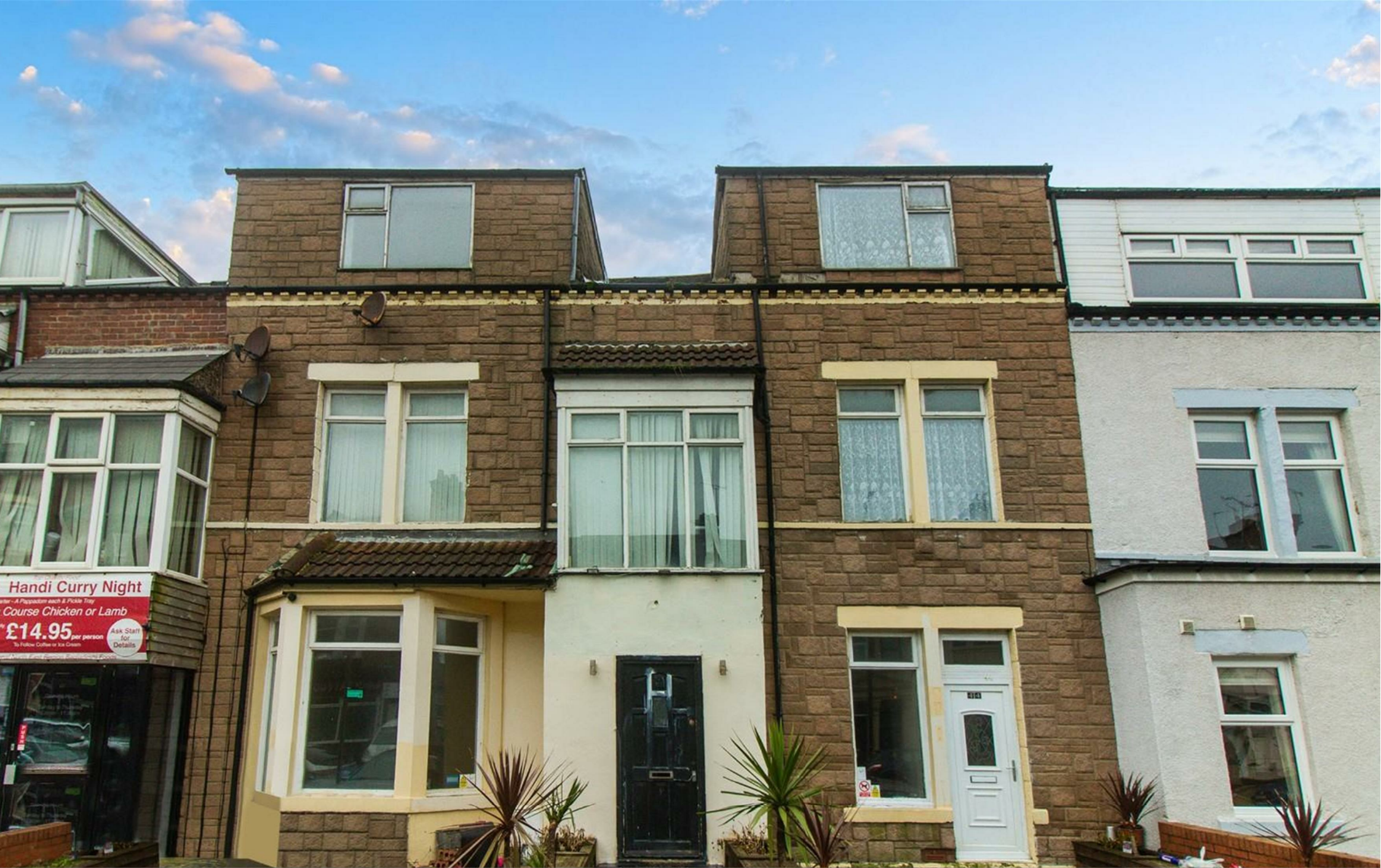
📍 Esplanade, Whitley Bay NE26 2AE